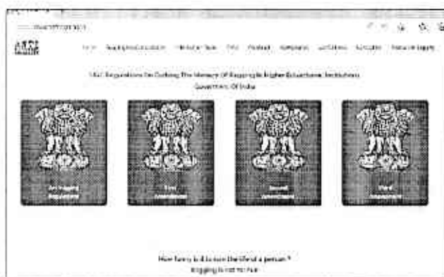
UGC Regulations www.antiragging.in/assets/pdf/annexure/Annexure-I.pdf

ATTESTED FRANCIS ABBAS KHAN COLLEGE FOR WOMEN OTC Road Cross, Gubbinpet BCLGALURU - 560 002