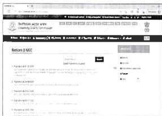
Notices @ UGC www.ugc.ac.in/ugc_notices.aspx

Ragging is a criminal offense and UGC has framed regulations on curbing the menace of ragging in higher educational institutions in order to prohibit, prevent and eliminate the scourge of ragging. In pursuance to the Judgment of the Hon'ble Supreme Court of India dated 08.05.2009 in Civil Appeal No. 887/2009, in exercise of the powers conferred by clause (g) of sub-section (1) of section 26 of the University Grants Commission Act, 1956, the UGC notified "Regulations on Curbing the Menace of Ragging in Higher Educational Institutions, 2009". These regulations are mandatory for all universities/ institutions.